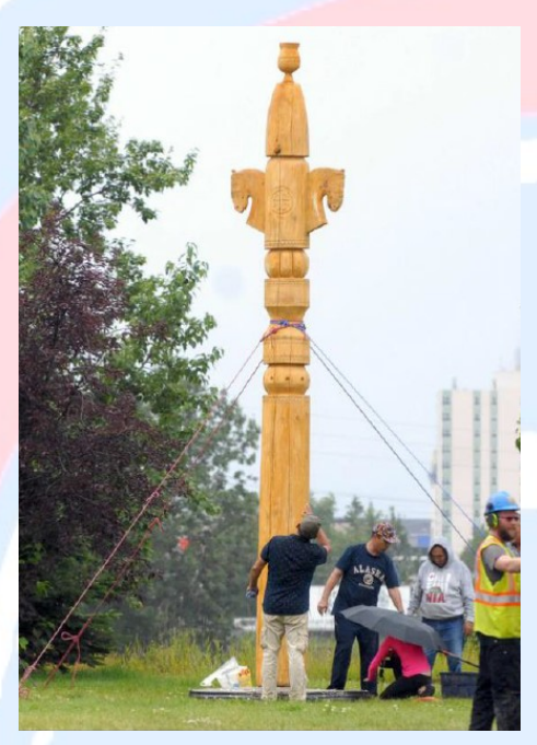
The "Serge" friendship totem erected in Anchorage July 28, 2018 following the RAPP meeting.

STATE CAPITOL P.O. Box 110001 Juneau, AK 99811-0001 907-465-3500 fax: 907-465-3532